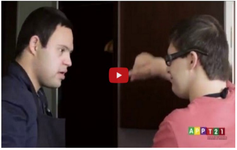
Click on the image to watch the video

Furthermore the OMO's managing group has developed 14 short videos (about 3 minutes each) that describe good and bad practice in the relationship between the trainee with intellectual disabilities and their tutor, as well as with other co-workers.