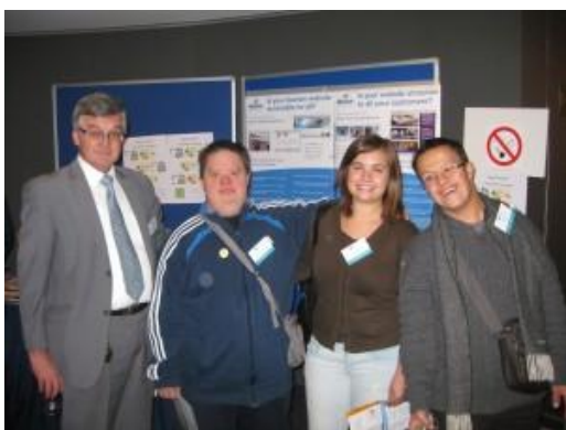
The Smart tourism delegation in Brussels.

They presented the city guidebooks at the conference for the International Day of people with disabilities (3 rd December 2013).