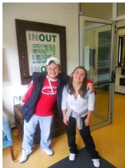
Working at In&Out Hostel