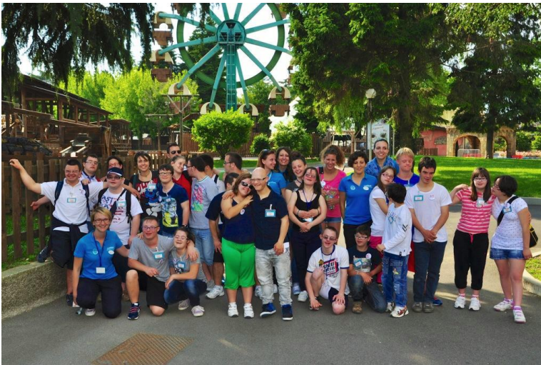
"A ride for everyone" project's participants

Read more: http://www.coordown.it/www/article.php?id=582