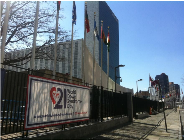
Our poster at UN Building

During the “Health and Wellbeing – Access and Equality for All” conference, people, with different points of view and from different countries talked about their fight to get a proper health management and understanding of their problems.