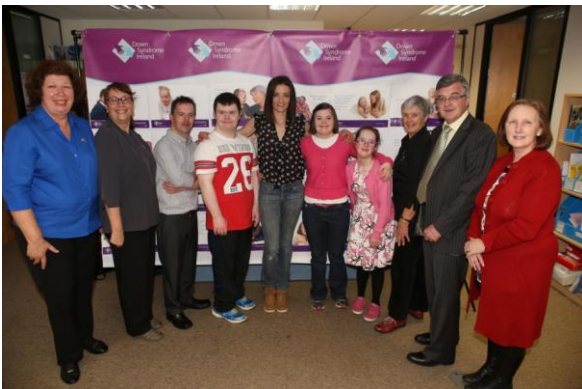
University of Queensland and Down Syndrome Ireland

An innovative literacy programme, which can greatly enhance the lives of Irish adults with Down syndrome is being expanded to include postgraduate programmes this year. During 2012, in partnership with Queensland University in Australia, the first Irish students with Down syndrome took part in a unique programme called Latch-On (Literacy and Technology Hands-On), an evidence-based, literacy programme, which provides opportunities for adults with an intellectual disability to continue their literacy development in a post-secondary environment, using computer technology to enhance literacy, self-confidence, independence and employment opportunities. The comprehensive programme runs over two years. For more information, see www.downsyndrome.ie