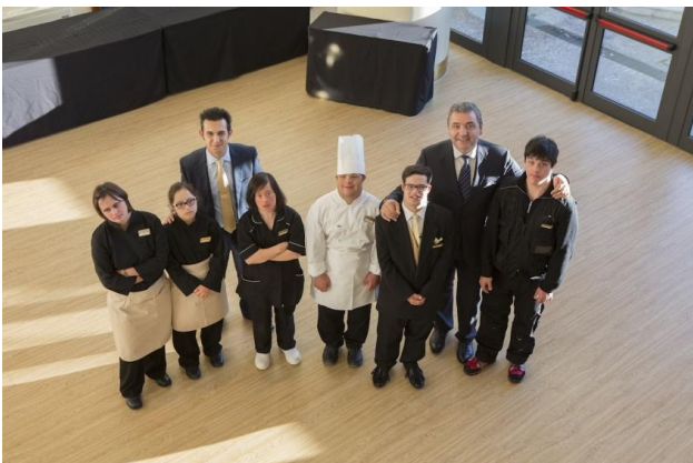
The 6 stars hotel's cast

http://www.hotel6stelle.rai.it/dl/portali/site/page/Page-4f7a3b53-9f7f-46ee-bd2a-2a7525991085.html