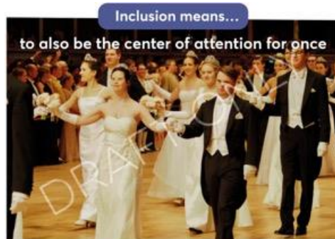
World Down Syndrome Day 2022