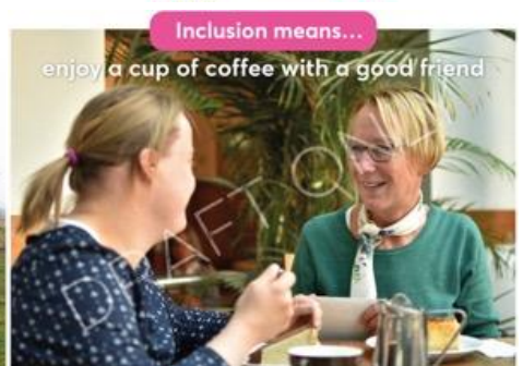
World Down Syndrome Day 2022