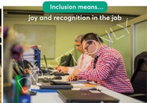
World Down Syndrome Day 2022