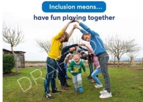
World Down Syndrome Day 2022